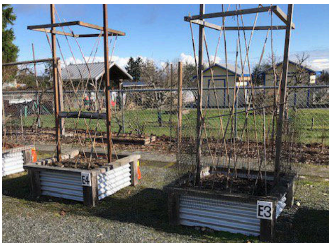
East boxes near Berry Lane